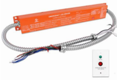
EM BATTERY BACKUP