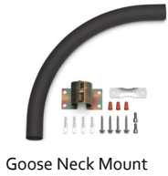
Goose Neck Mount